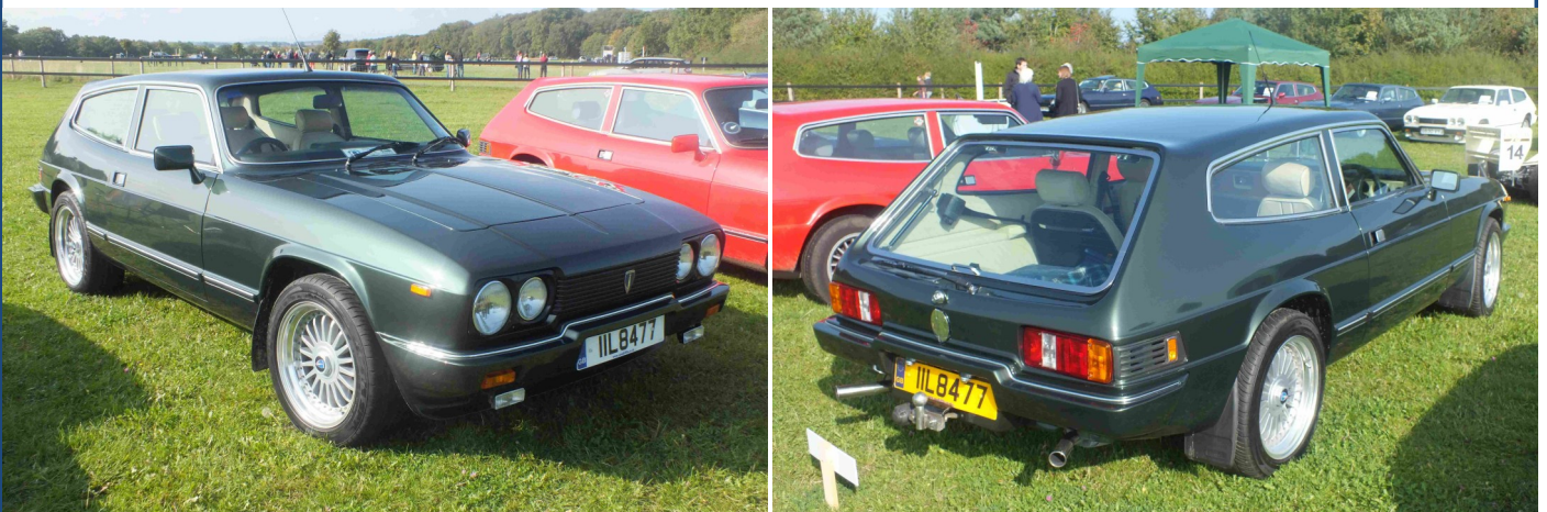
Middlebridge 43 at Gatcombe 2014