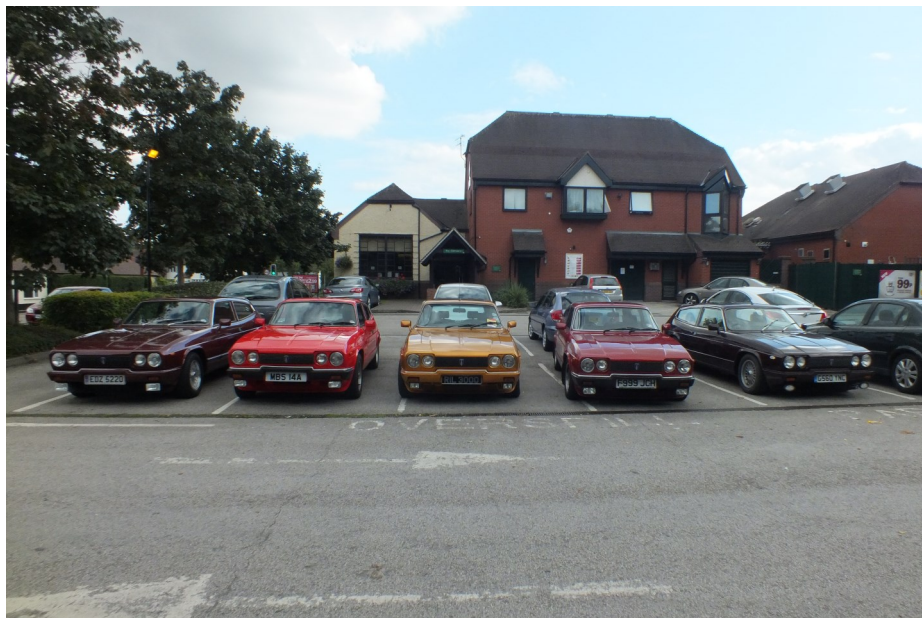
Middlebridges 40, 14, 33, 13 & 63 outside the Bee Keeper 2013