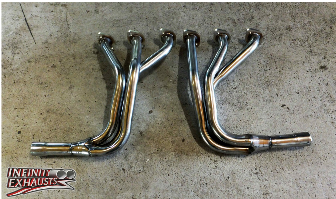
Shiny Manifolds before Fitting

On a good run I noted that my engine was running a little rough on tickover/low down, on checking this we discovered that the primary air flow meter fueling level was way down and the secondary also slightly down, when these were adjusted and set it made quite a significant difference to the cars performance. This was quite a surprise and shows the difference that a quality, properly set-up freeflow system can make. ;o)